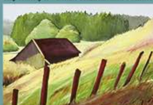
13 Joyce Crain

*some images are details of the original work