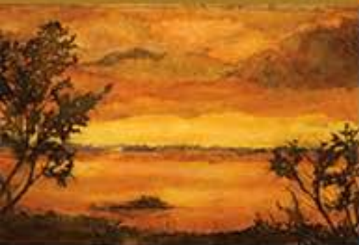
1 Gallery San Juan

Hours: Galleries Saturday 10-8, Sunday 10-6; Artist Studios 10-4:30 both days