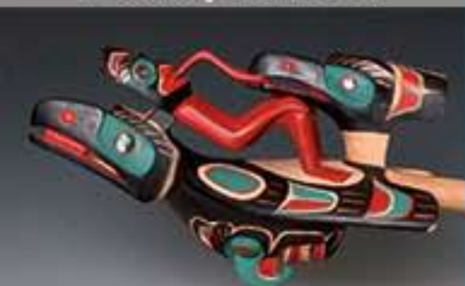
2 Arctic Raven Gallery