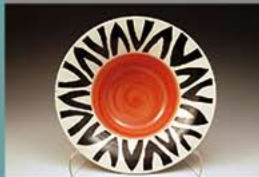
11 Paula West Pottery