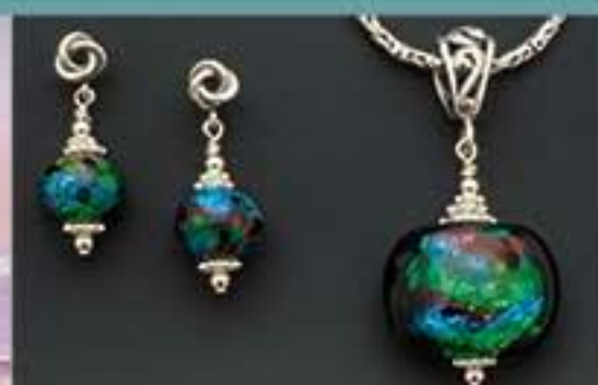
9 Darleen's Designs