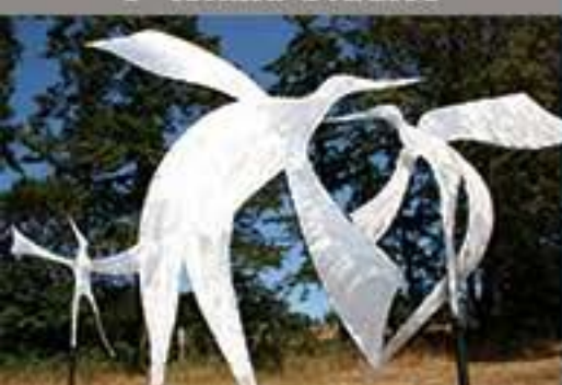
4 Island Museum of Art