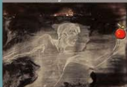
12 San Juan Glassworks