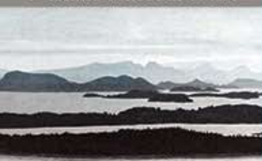
5 Waterworks Gallery