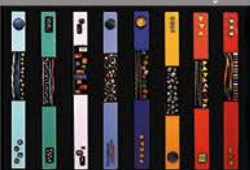
3 Island Studios