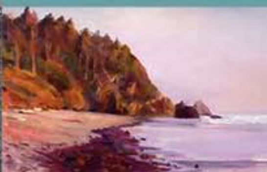
8 Kristy Gjesme Studio